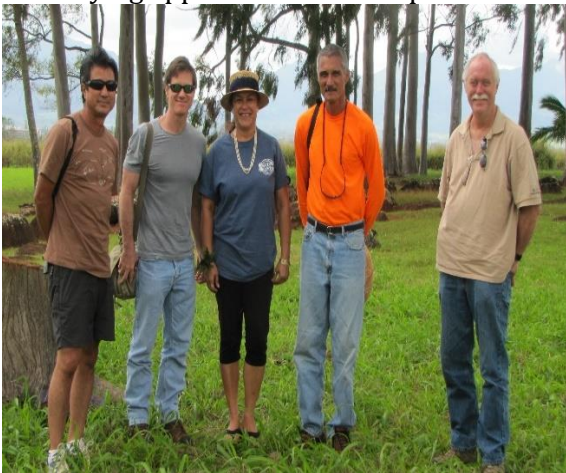
in attendance...

'Ōlelo No'eau...Mary Kawena Pukui...#1104 Ho'onohonoho i Waineki kauhale o Limaloa. Set in order at Waineki are the houses of Limaloa. Limaloa, the god of mirages, made houses appear and disappear on the plains of Mānā. This saying applies to the development of ideas, the setting of plans, or the arranging of things in order.