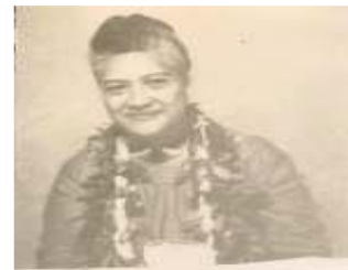
Kupuna Pilahi Paki